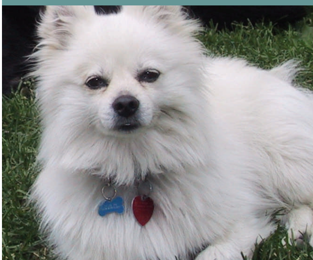
Rocky enjoying the outdoors. Ah sweet spring!

The Dog Owners' Association of Deux-Montagnes is pleased to be the first to announce to its members that the dog park will finally be opened—in a matter of days! The big day is June 6 at 12:30pm, immediately following the end of the expert dog trainer presentation (see item below).