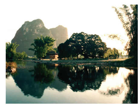
Day 17 Yangshuo - Guilin (B L D) Return to Guilin by bus , visit in Guilin for Elephant Trunk Hil, and free time downtown

Full day visit in Yangshuo, a Cruise for Liriver and visit beautiful Yangshuo countryside.